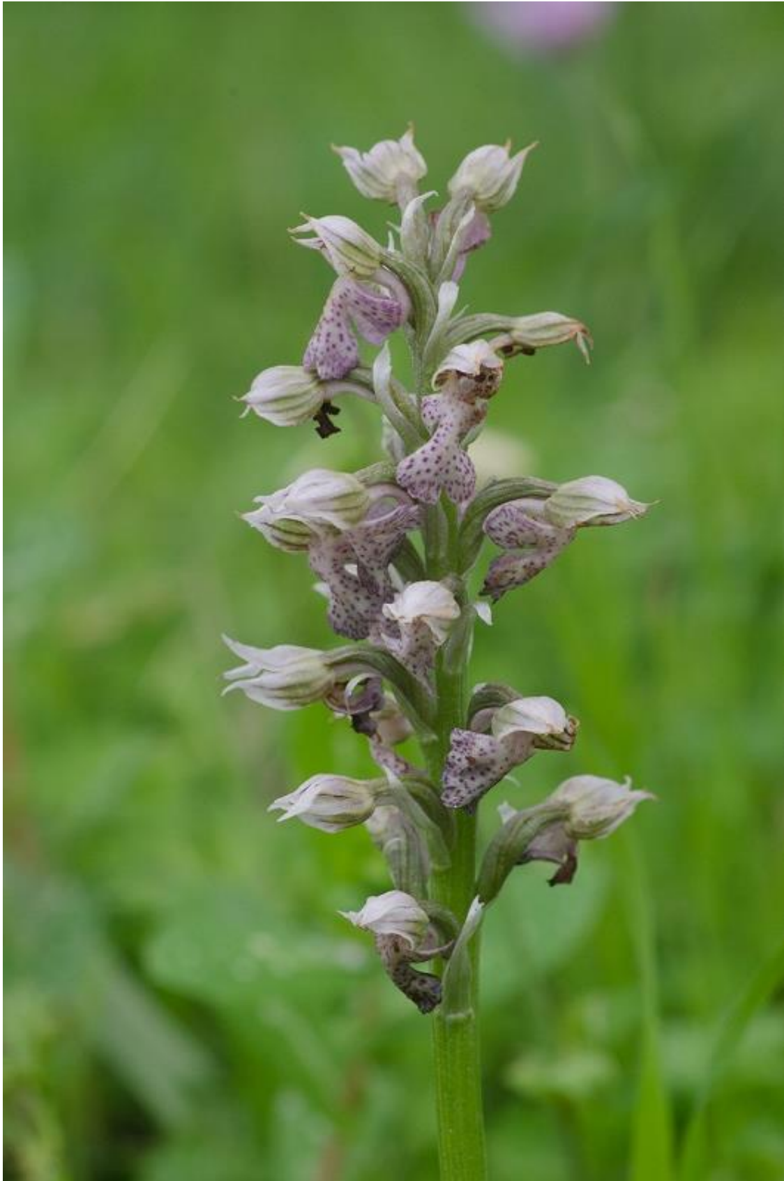
Fig. 2. Neotinea lactea , Paleokastron