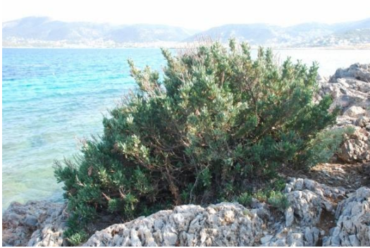
Fig. 4. Habitat of L. monopetalum , Porto Rafti