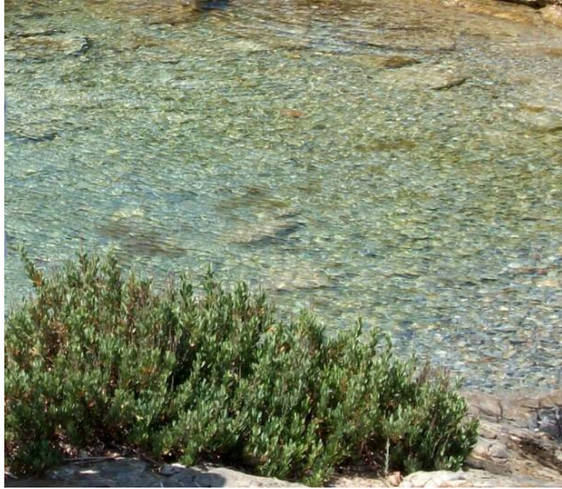
Fig. 2. Habitat of Limoniastrum monopetalum from Chamolia.