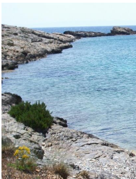
Fig. 1. Habitat of Limoniastrum monopetalum from Chamolia.