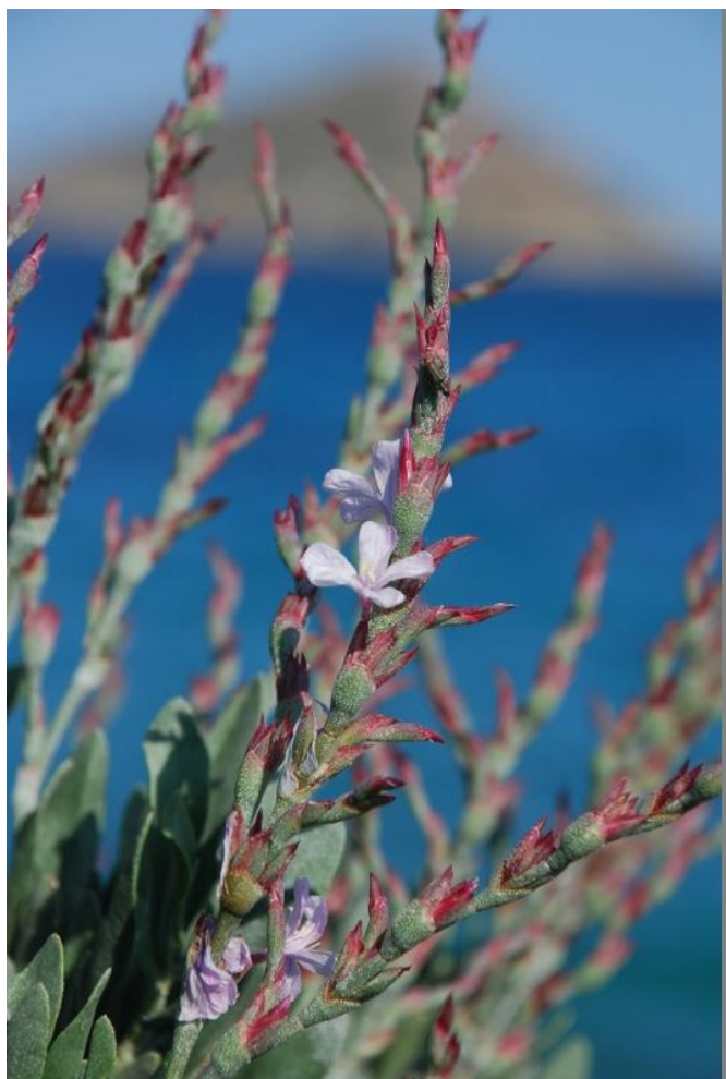
Fig. 7. Flowering shoots of Limoniastrum monopetalum , Porto Rafti