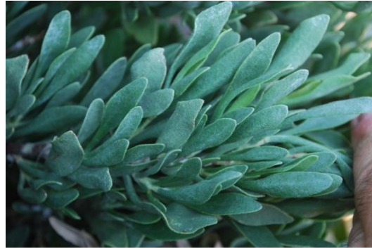
Fig. 5. Leaves of L. monopetalum , Porto Rafti