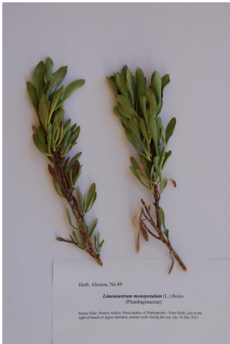
Fig. 6. Herbarium material of Limoniastrum monopetalum from Porto Rafti, Herb. Alexiou.